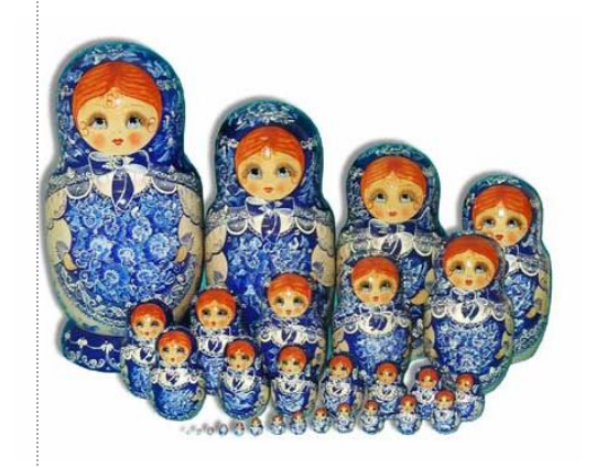
Спасибо за внимание