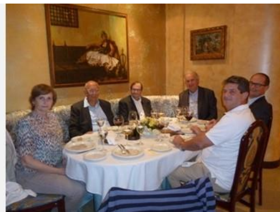
Invited experts from CEN/TC250 "Structural Eurocodes" enjoying the social dinner