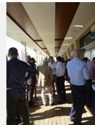
Workshop participants socializing at the workshop breaks