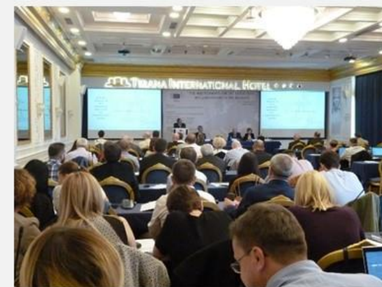
View of the workshop venue