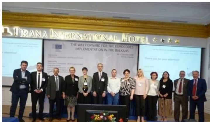
Group photo of non-EU Balkan countries speakers with the JRC Organizing Committee